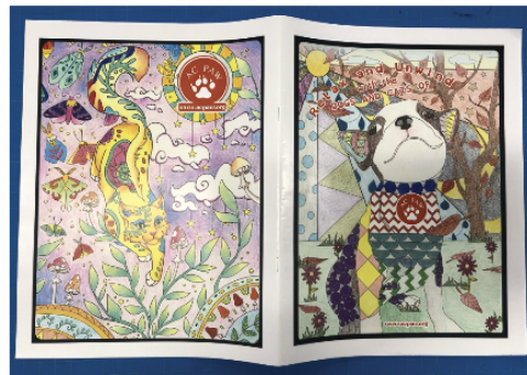
Group Project GAA/GAB, MITES, 1st Place