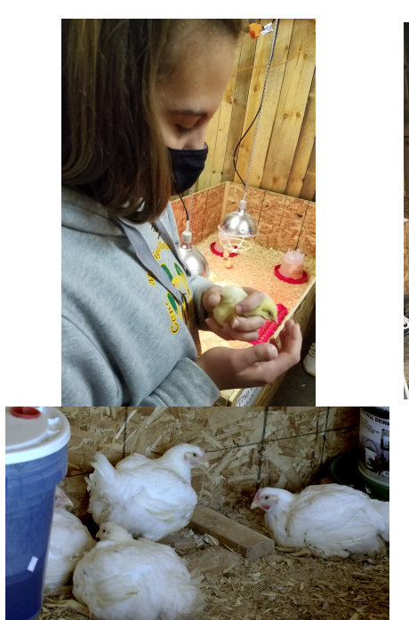
<u>100 Broiler</u> Chickens Raised