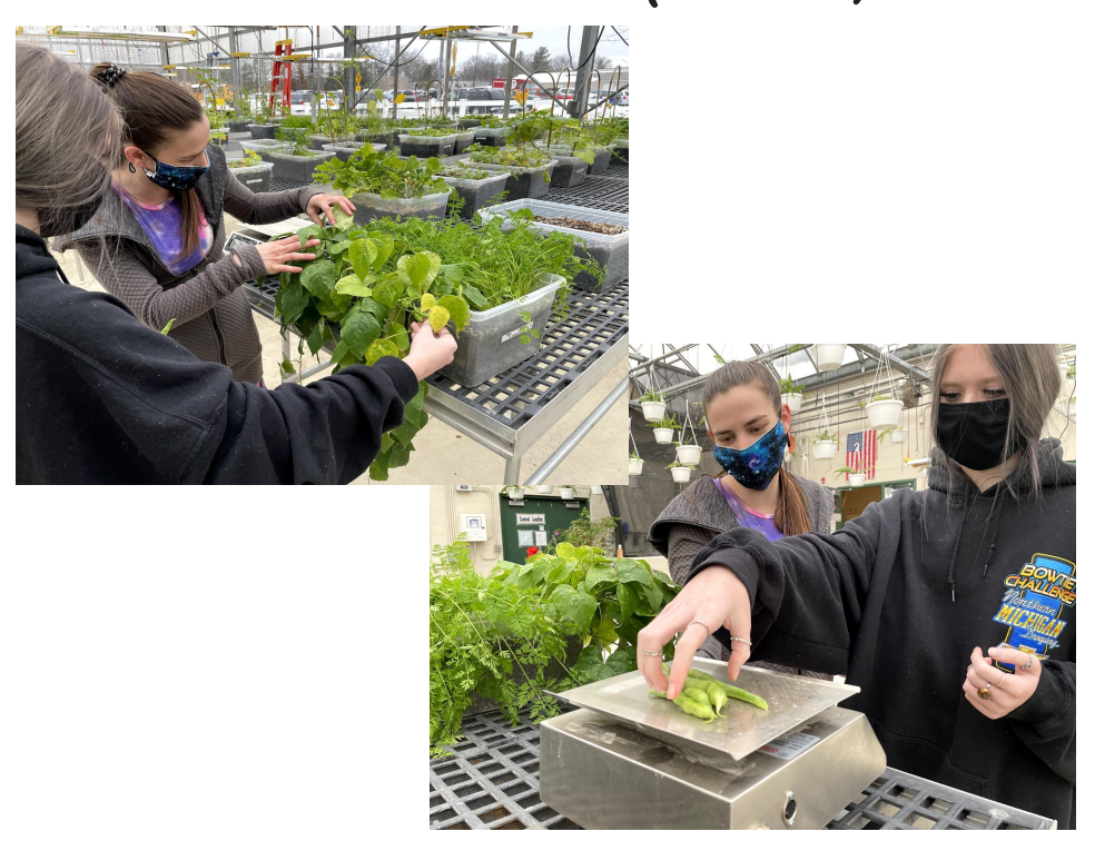
Square Foot Gardening