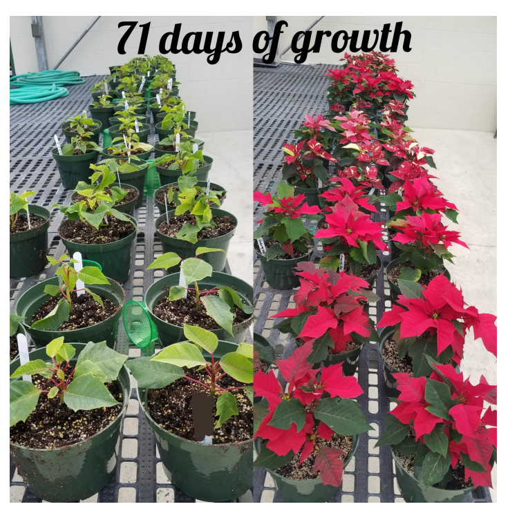
200 plant crop of poinsettias