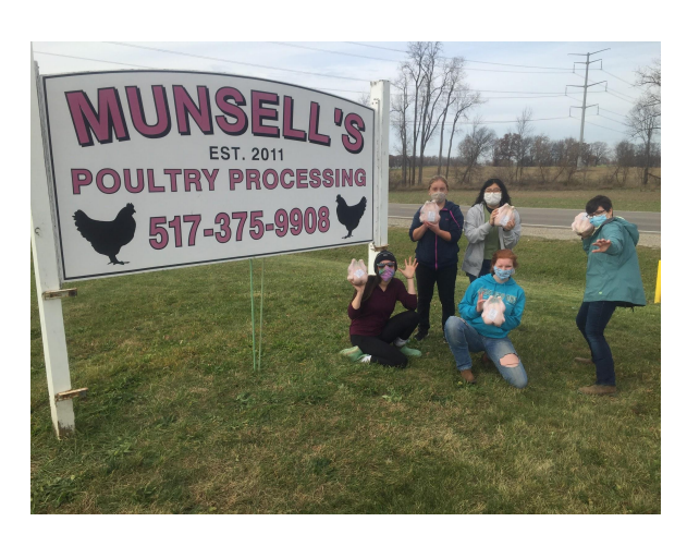
<u>Michigan FFA Broiler</u> <u>Contest - 2020</u>