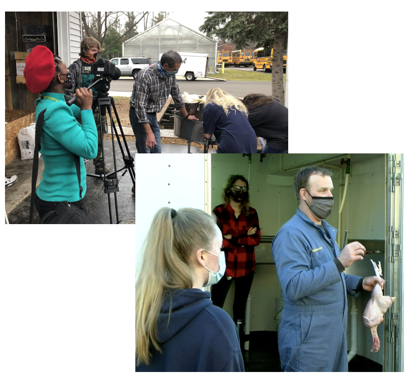
Poultry Processing Demonstration (November 2020)